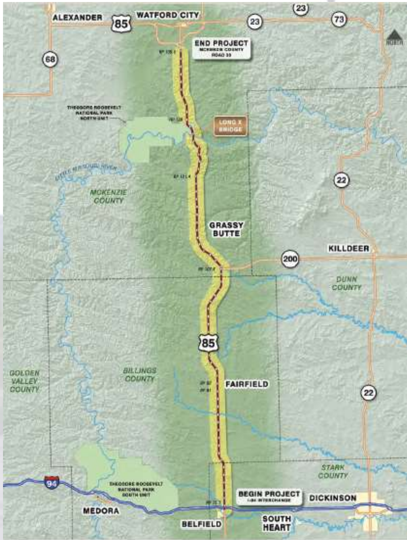
Figure E8-1. Project Location Map